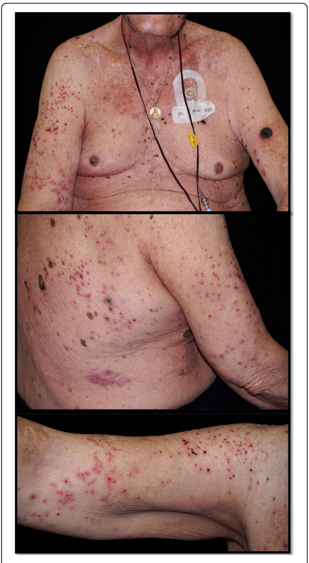
Fig. 3 Kaposi's varicelliform eruption. Scattered 2–3 mm eroded and crusted papules on the bilateral upper arms and trunk. Lesions are concentrated on the right upper arm and trunk

In anticipation of a second cycle of T-VEC, the patient returned to clinic on cycle 4 day 22. On examination, a diffuse eruption of eroded papules was noted on his bilateral upper extremities, chest, flank and back (Figure 3A-C). A few intact vesicles were visible on the right forearm. The lesions were notably asymmetrical in distribution, with the highest density occurring on the right upper arm and right chest. The patient was afebrile and reported mild pruritus of the eruption, which he reported began a few days previously. A Tzanck smear was performed from one of the intact vesicles. Multinucleated giant cells with cytopathic changes were noted (Figure 4). Due to concern for Kaposi's varicelliform eruption (KVE), the patient was started on intravenous (IV) acyclovir. A direct fluorescence antibody test performed on a vesicle confirmed HSV1 infection. A skin biopsy demonstrated epidermal ulceration with acute inflammation and viral cytopathic effects. HSV I/II-specific immunoperoxidase stain was positive, while a specific immunostain for VZV was negative. HSV viremia was not detected by polymerase chain reaction. He was given 48 hours of IV acyclovir